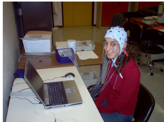
Fig. 1. Test apparatus in a subject of 19-30 age class.

There are some evident results within an age class. The MMN component always shows smaller amplitudes in target ERP than in novel ERP for every age class and every test. MMN has a distribution central-oriented in auditory tests and parietal-oriented in visual tests for every age class.